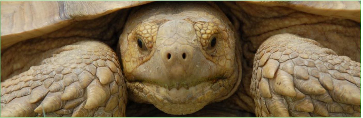
Rainfall, green grass and cooler temperatures bring the spurred tortoise out of its hot season burrows