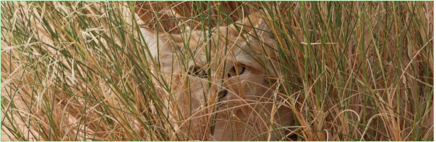
This wily and rarely seen sand cat takes cover behind a tussock of grass