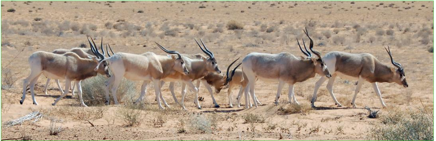
A fine herd of reintroduced addax in their winter coats graces Tunisia's Jbil National Park