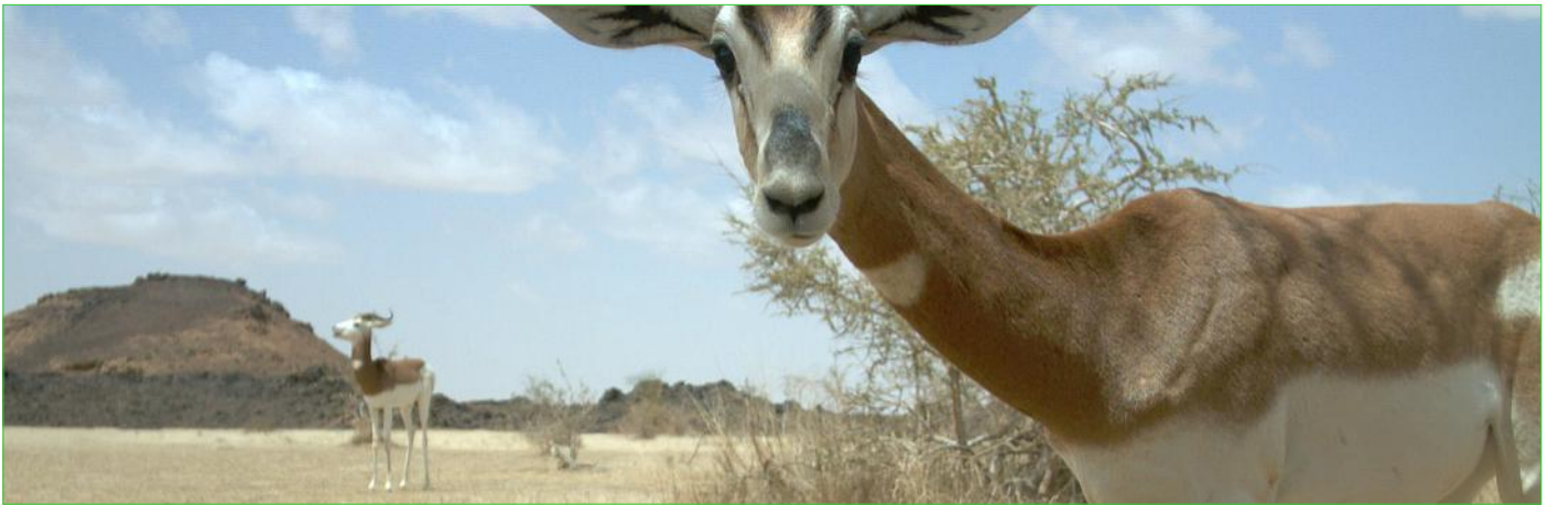
A remote camera captures two of Termit's precious dama gazelles