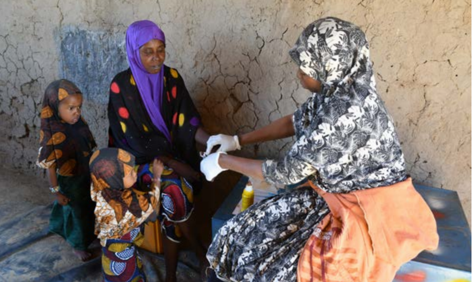
MAKING HEALTH A PRIORITY. Though challenging in terms of administrative constraints and logistics, the health missions conducted by SCF and ESAFRO are greatly appreciated by the communities in remote areas. With relatively modest resources, these missions provide primary health care and vaccinations to hundreds of people.