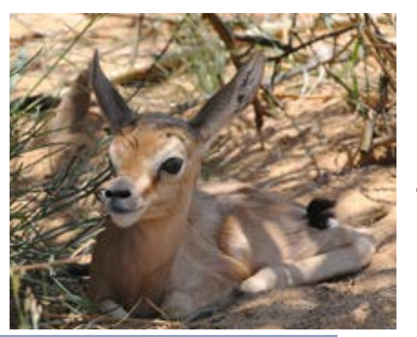
addax, oryx, & dama gazelles little rays of light