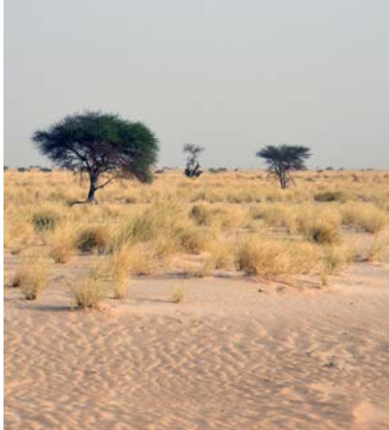
GOING TO THE WELL. These photos are all emblematic of the Ouadi Rimé-Ouadi Achim Game Reserve, with regard to the landscape, water sources that are critically important for nomadic people and their livestock, or the vibrant colors.