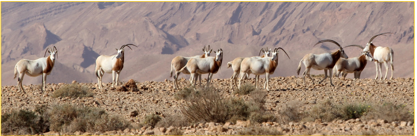
Tunisian biodiversity: scimitar-horned oryx (above); wildflowers, slender-horned gazelle, ostrich and addax