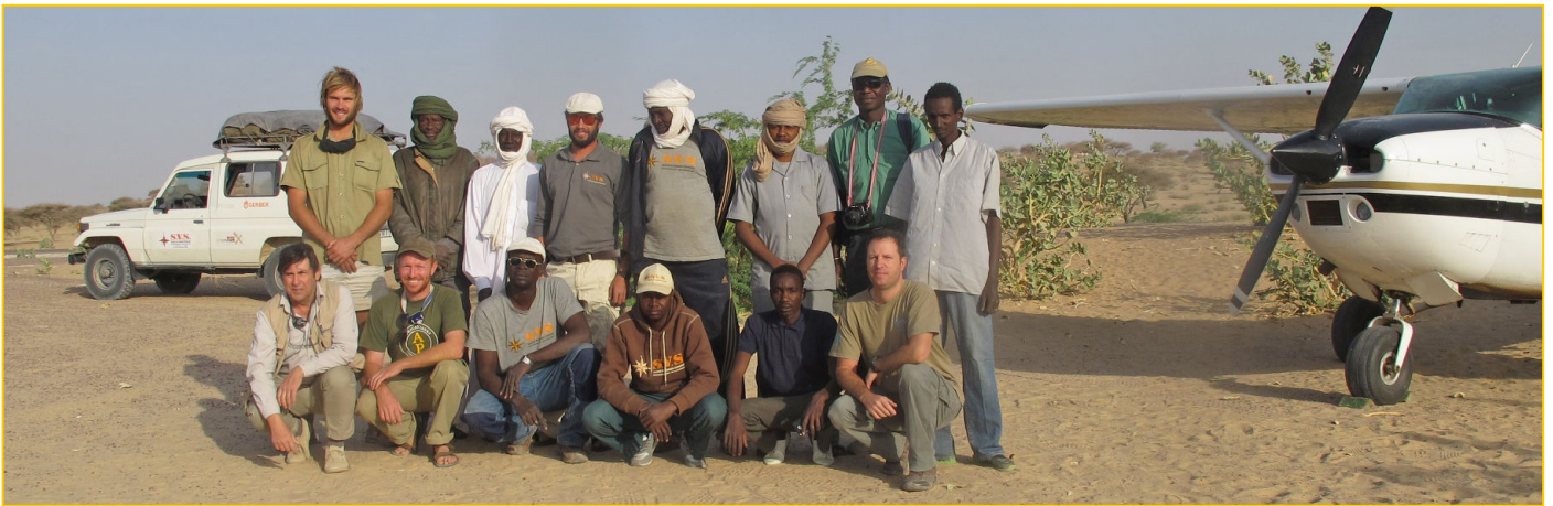
Manga, Chad, ground and aerial survey teams (above); dama gazelles, Manga pastoralist