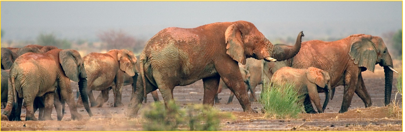
Mali's elephants on the move (above); poached elephant, elephants at Lake Banzena, community meeting (sidebar)