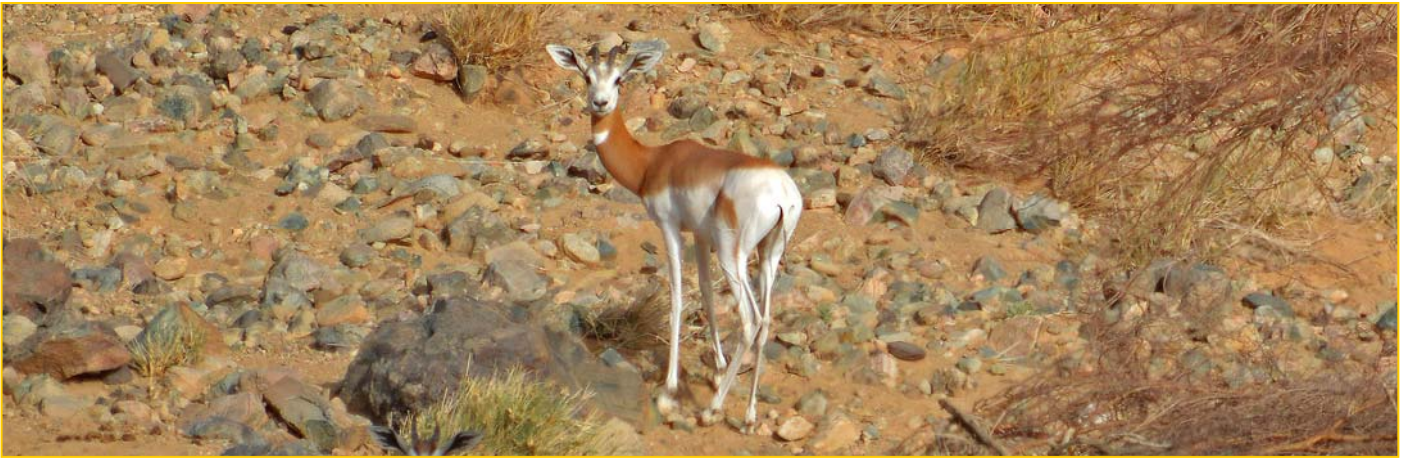
Richly-coloured dama gazelle on the stony plateau of the Takolokouzet Massif in the Air Mountains of Niger