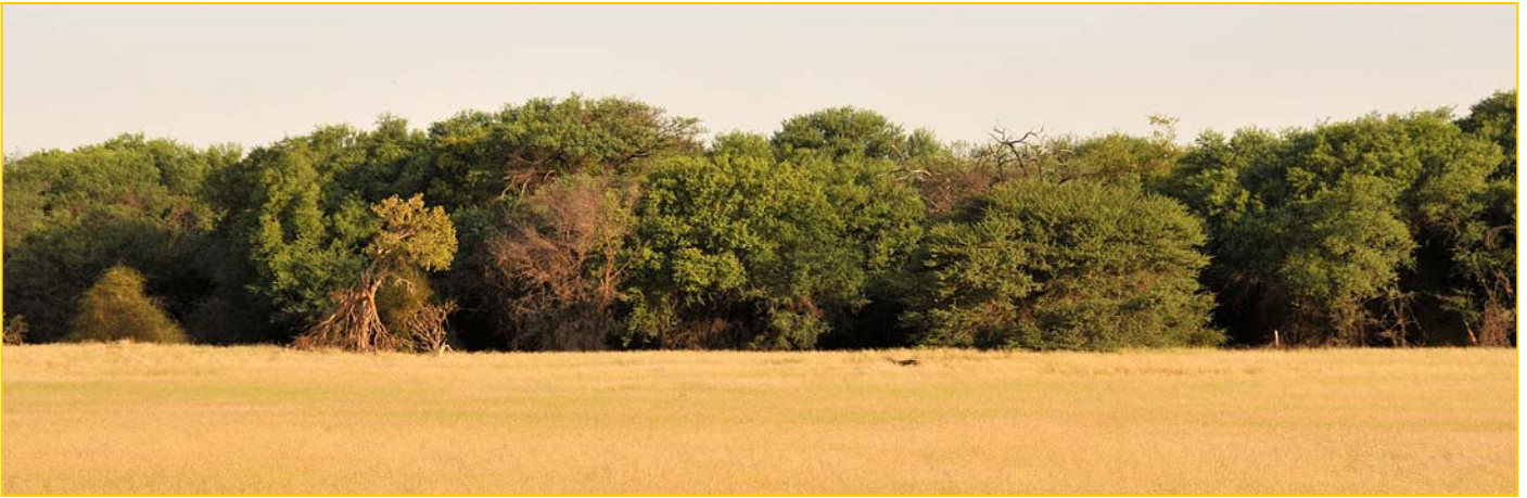
Dense riparian woodland along the banks of Chad's Ouadi Kharma