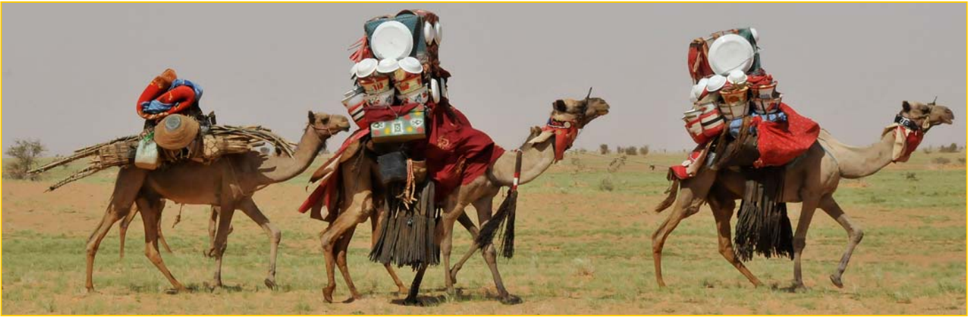
Transhumance in Chad (top), herder and child (below), bushfire (bottom)