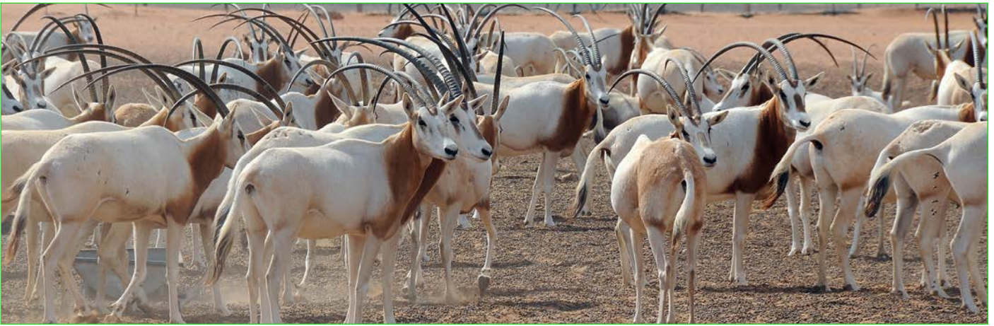
Part of Abu Dhabi's magnificent captive population of Scimitar-horned Oryx