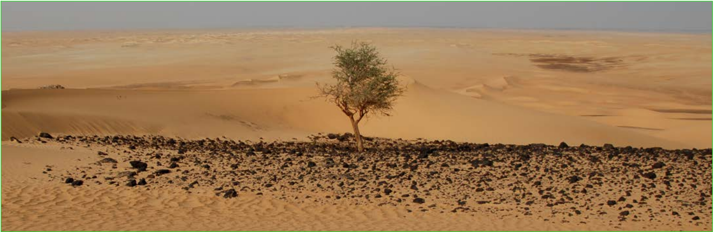
The austere and timeless beauty of the Termit & Tin Toumma National Nature Reserve