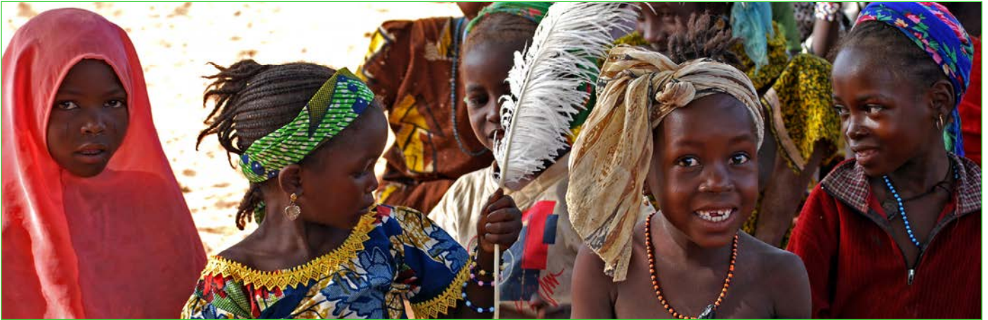
The success of our conservation work will depend largely on school children like these from the Zinder region of Niger