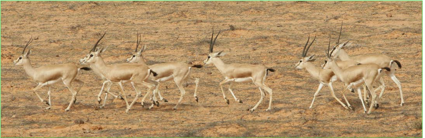
A fine herd of slender-horned gazelles in the Sidi Toui National Park in Tunisia