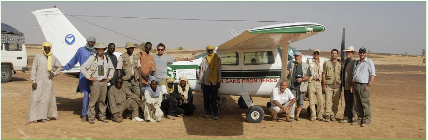
Termit and Tin Toumma ground and aerial survey teams, Niger, November 2007