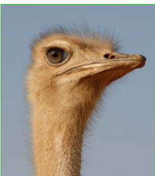
The tallest mammal and the tallest bird: Niger is leading the way in conserving West Africa's unique