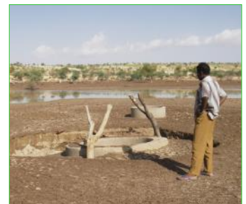
Loss of wells like this one at Tesker in Niger can deal a crippling blow to people and their livestock.

***** ★ "It is important to listen to ★ people who have been in the ★ desert for some time. To ask ★ for too much water is to in- ★ voke disaster. Only in a place ★ like this would you bow your ★ head and humbly request ★ just the water you need and ★ no more." ★ ★ Craig Childs ★ ★*****