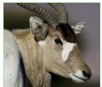
Addax in Tunisia

creatures, including ourselves, the same way we observe stars of the night sky – with unspoken questions hanging from our mouths. To be privy to the eradication of a species and to know damn well what is going on is a shame beyond repair.”