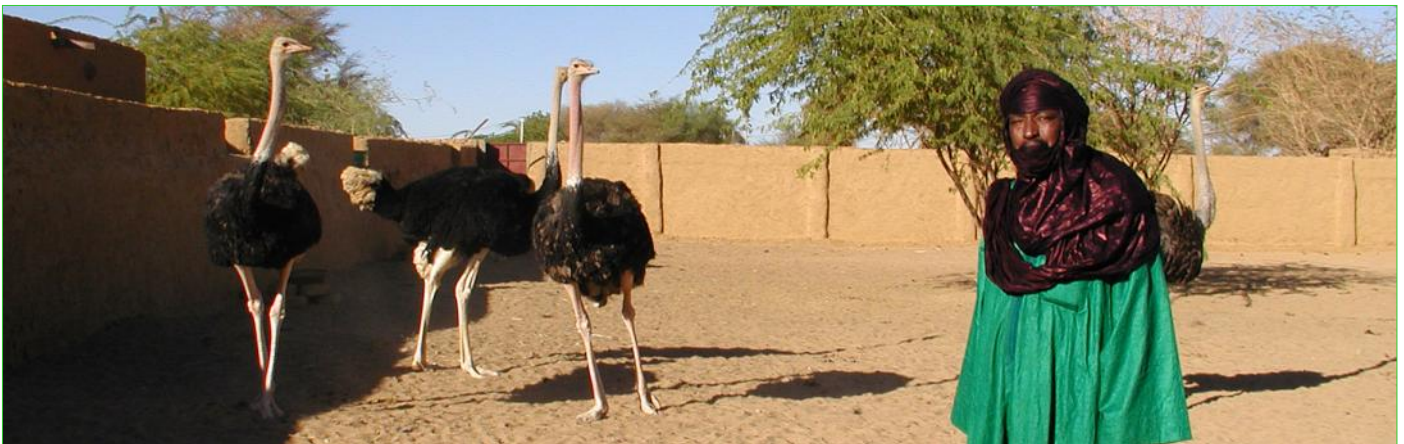
Alhousseini Alghaler of Niger NGO GAGE-Azihar looks after some of the Sahara's last ostriches