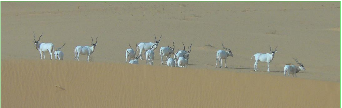
Some of the world's last wild addax spotted by SCF's project team in Niger, May, 2007