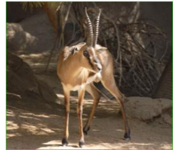
Cuvier's Gazelle at San Diego Zoo.

For all that they do to ensure a future for wildlife in the Sahara, SCF salutes the Zoological Society of San Diego, the San Diego Zoo, and the San Diego Wild Animal Park as true Friends of the Sahara.