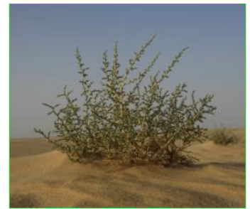
Cornulaca monacantha: good for addax, good for camels and good for controlling desertification.

smaller desert species, including lizards, beetles and gerbils. Addax will often shelter from fierce sandstorms and shade themselves from the burning sun behind especially large specimens. All in all, it's a true keystone species and desert all star.