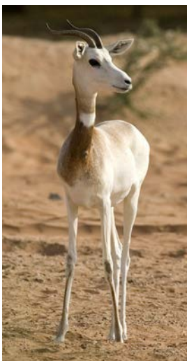
Xavier Eichacker/ Al Ain Zoo