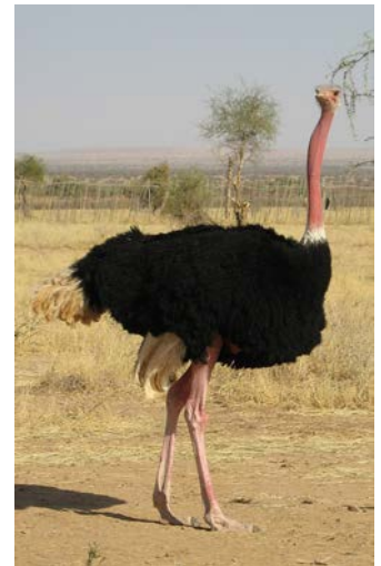
Sabaran, red-necked ostrich in full breeding colours.

Financial support for this project has come from St Louis Zoo, Disney's Animal Kingdom and the Institut de France. Mulhouse and Paris zoos have provided technical advice. With support from AZA's Ratite Advisory Group, it is hoped to make this project the success and model it deserves to be.