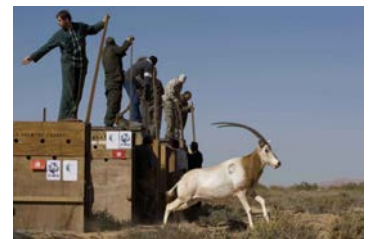
Safe and sound: oryx and addax regain their freedom.

of maximizing Tunisia's antelope gene pool. Led by Hannover Zoo, Marwell, the Saint Louis Zoo and the Living Desert, over 30 organizations are collaborating to transport additional animals to Tunisia later this year and to provide ongoing support for reintroduction efforts (see box).