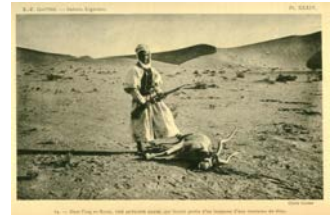
Dorcas gazelles and addax have suffered massive declines from over-hunting over many years.