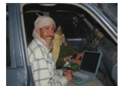
Data collection in Algeria.

Training in survey techniques is a key component of SCF input, with data recorded as GPS waypoints, downloaded to laptops for analysis and resource mapping.