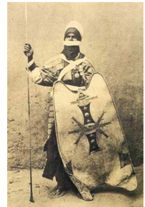
Twareg warrior with oryx-hide shield.

bly to local economies and by doing so, create the incentives for its conservation and survival. Ecotourism is one good option and there is already interest from the tourism sector to work with us to identify win-win solutions that provide returns without compromising conservation objectives.