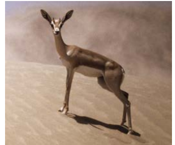
The Dorcas Gazelle was once abundant throughout the Sahara.

In this issue read about SCF's projects in Niger, Tunisia and Algeria, learn about emerging issues and share the wonder